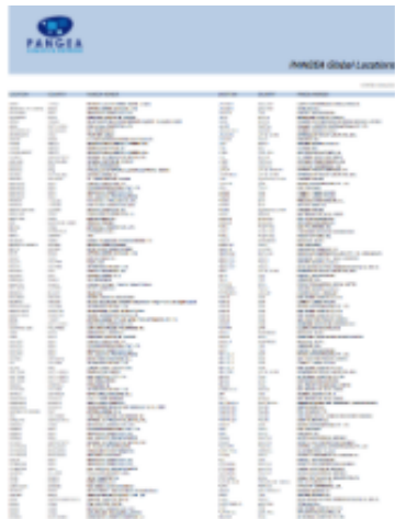
Members Short List