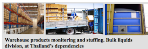
Warehouse products monitoring and stuffing. Bulk liquids division, at Thailand's dependencies