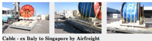
Cable - ex Italy to Singapore by Airfreight