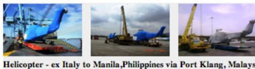
Helicopter - ex Italy to Manila, Philippines via Port Klang, Malaysia