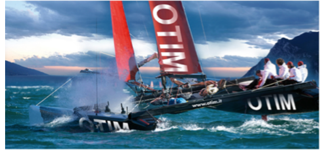
freightforwarding ... & mor

OTIM is the ideal partner for any need in the field of international freight forwarding. Established in 1948 , OTIM has reached during over 60 years activity a dominant position in the market, adjusting itself to meet the increasingly complex needs of its clients.