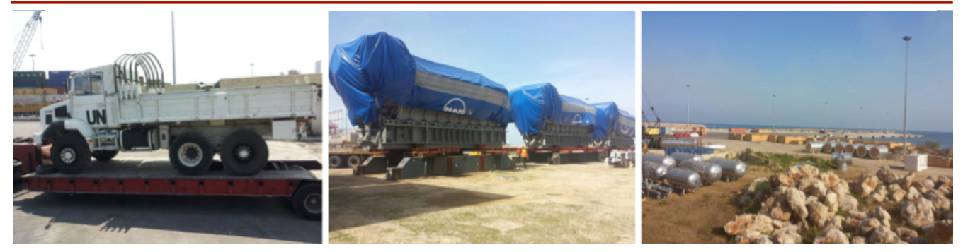
SONADE, new Member in Lebanon, Logistics and Freight handling leader

SONADE is a Lebanese established freight forwarder company, since 1992, in the logistics and sea land and air cargo handling industry. SONADE continuously seeks opportunities which will enable them to spread wings further and undertake movement of the cargo in the entire area.